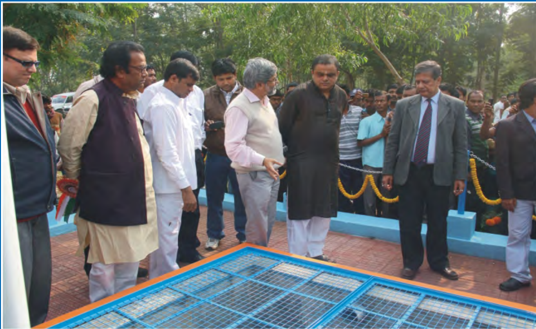
Shri Bratya Basu, Hon'ble Minister-in-charge, Higher Education, Govt. of West Bengal, inaugurated the Floortop Rainwater Harvesting Project in V.U.

Published by the Registrar Vidyasagar University Midnapore - 721102