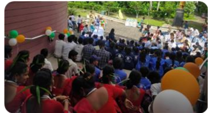
Independence Day Celebration at Vidyasagar University on 15 th August, 2025