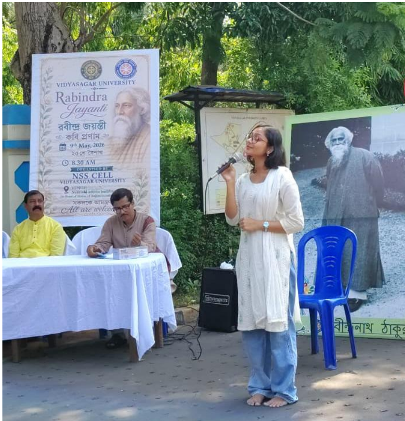
Rabindra Jayanti Programme at Vidyasagar University organized by NSS Cell on 09.05.2026