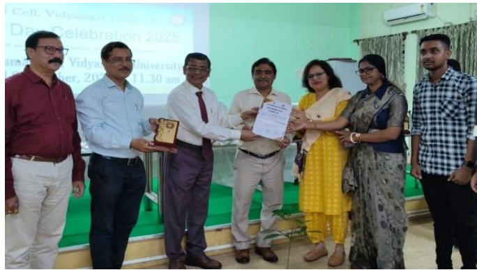
NSS Day Celebration and Annual NSS award distribution programme 2025