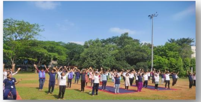
World Yoga Day programme at Vidyasagar University in June, 2025