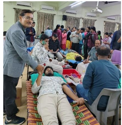
Blood Donation Camp at Vidyasagar University Campus in 2025