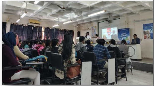
Yuva Connect Programme at Vidyasagar University in November, 2025