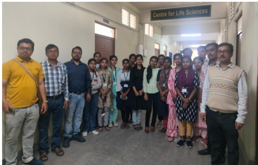
Visit of students of General Degree College, Keshiary to the Centre for Life Sciences on 24.02.2026