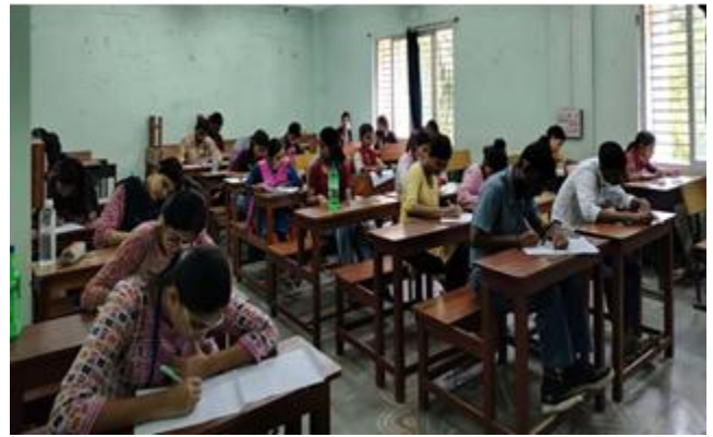
Sardar @150 different programmes on birth anniversary of Sardar Ballavbhai Patel at Vidyasagar University