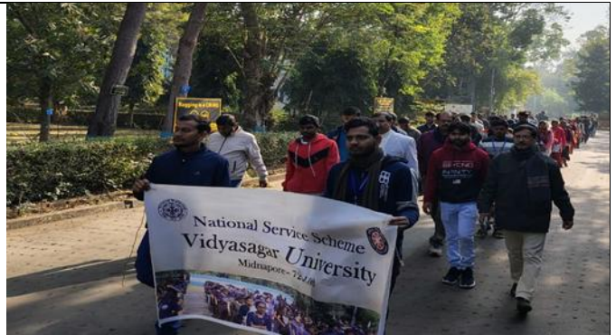
National Youth Day celebration on 12.01.2026 at Vidyasagar University