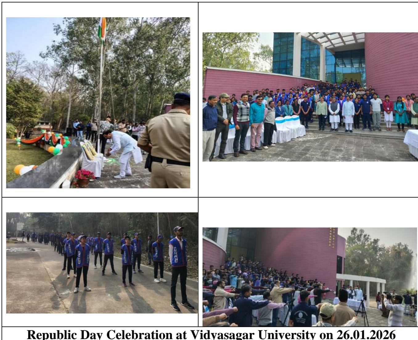
Republic Day Celebration at Vidyasagar University on 26.01.2026