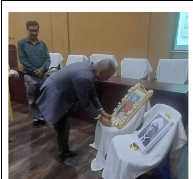
National Science Day programme organized by the Centre for Life Sciences on 27.02.2026