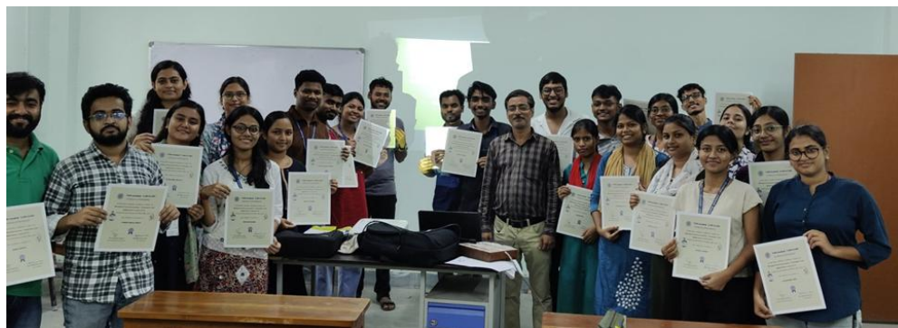
Distribution of certificates to the successful candidates of Certificate course on Biological Instrumentation (July, 2025)