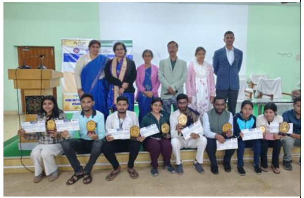
Youth Parliament programme at Vidyasagar University on 12.11.2025