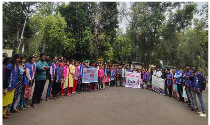
World AIDS Day celebration at Vidyasagar University on 01.12.2025