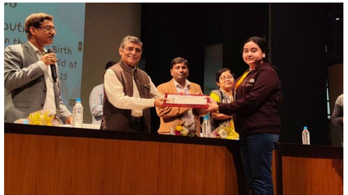
Induction programme of NSS Volunteers at Vidyasagar University in December, 2025