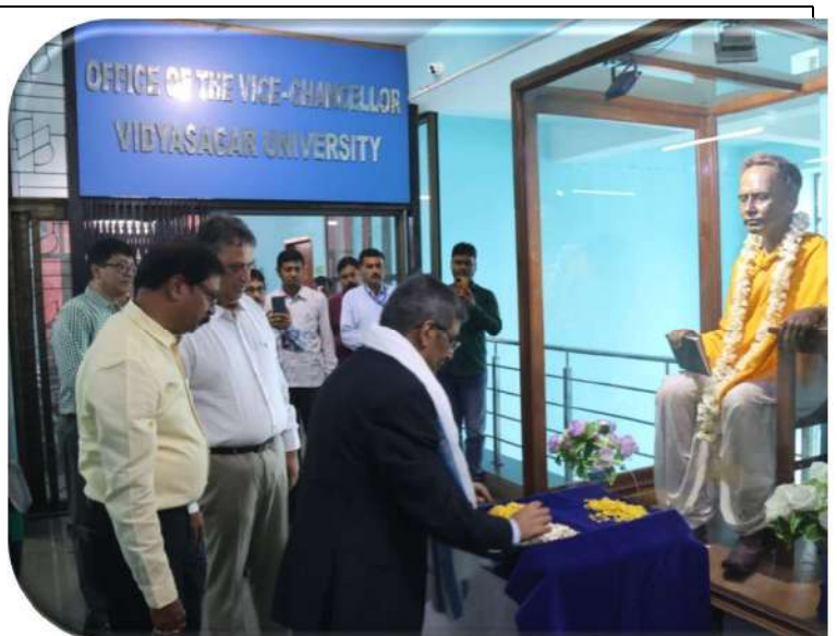
Hon'ble Vice-Chancellor paying homage to Swachandrade Vidyasagar, 19.03.2025