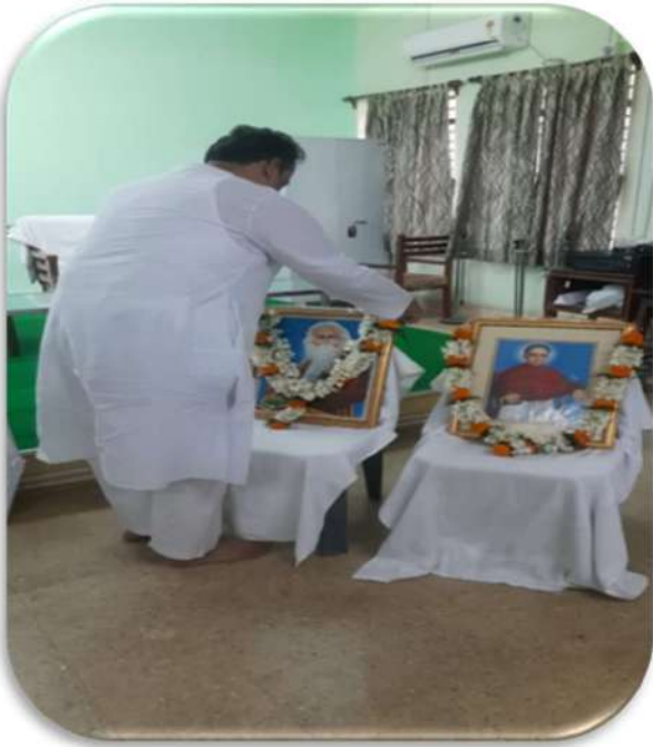
Rabindra Jayanti Programme at Vidyasagar University organized by NSS Cell on 08.05.2024