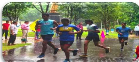
Red Run Marathon on 23.08.24