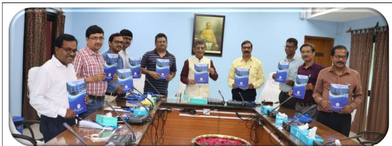
Launch of University Newsletter, 03.07.2025