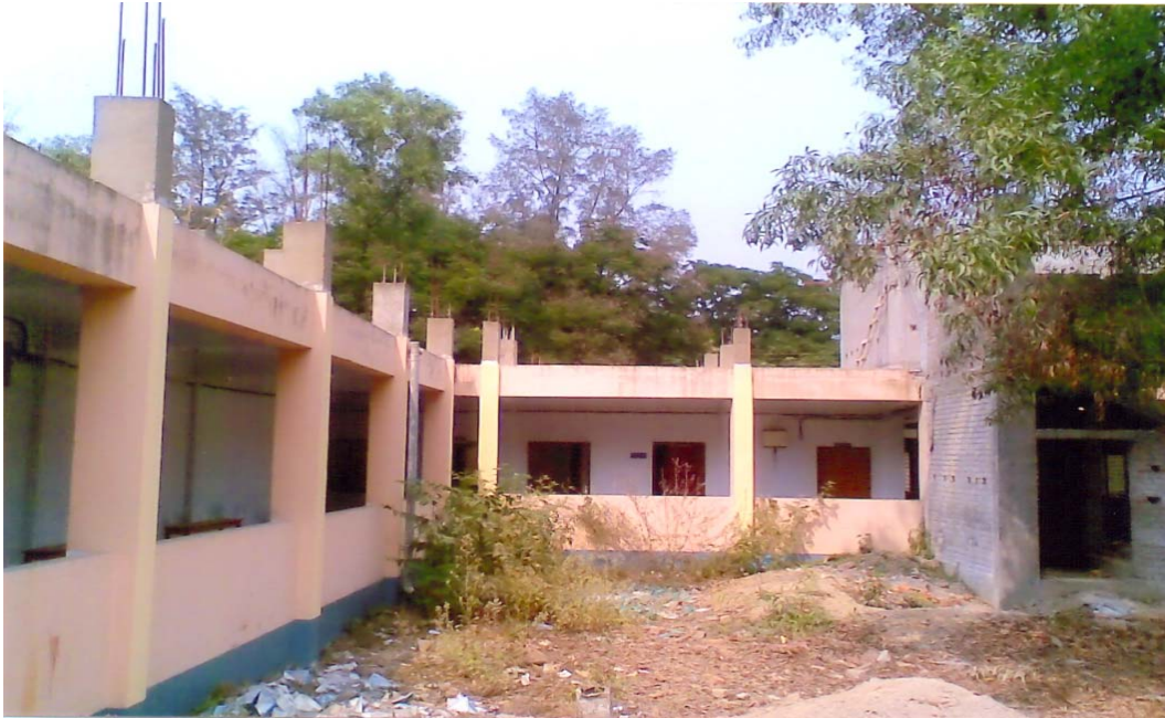
Vidyasagar University Silver Jubilee Building for MBA