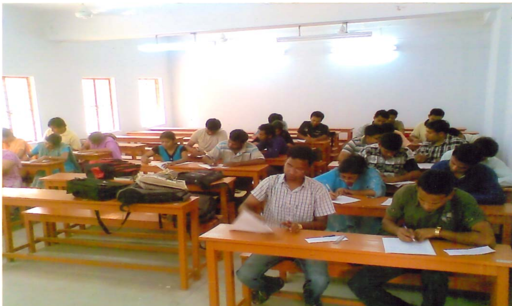
Vidyasagar University Class Room for MBA