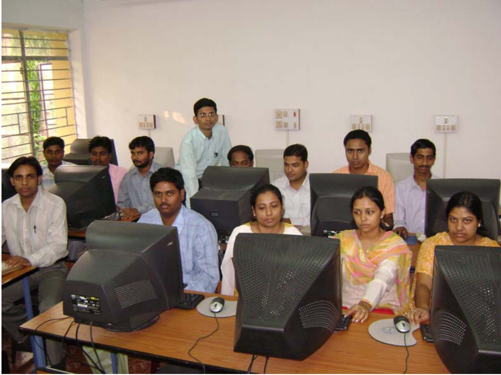
Computer Laboratory for Commerce and MBA