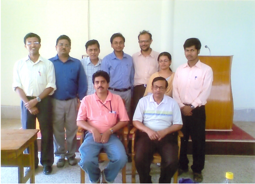
Vidyasagar University Teachers for Commerce & MBA